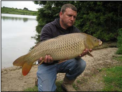
17lb 8oz Common stocked on 28/5/2009