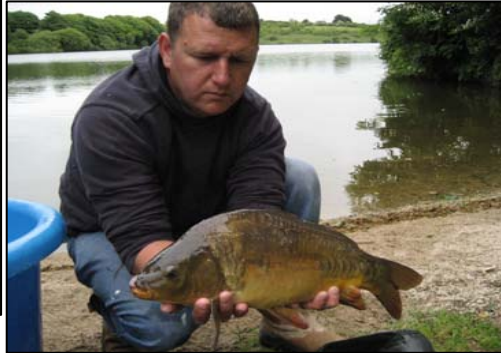
8lb Mirror stocked on 28/5/2009

If you have an interesting story or picture that you would like to be included in a future issue, or if you would like to be on the mailing list for this newsletter, please contact bsmeeth@swlakestrust.org.uk