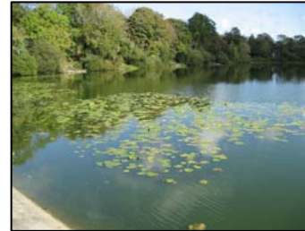
View from the dam wall

This is the second part of the short features detailing South West Lakes Trust Cornish reservoirs. This time it's summer fishing at Boscathnoe. Boscathnoe is a small reservoir tucked away in West Cornwall, near Penzance. It's a fairly prolific lake where big catches can be had during spring and summer; however the lake does fish all year round. The stock at Boscathnoe is very good in terms of 20lb plus fish, with some going over 30lbs just prior to spawning. The reservoir itself is around 4