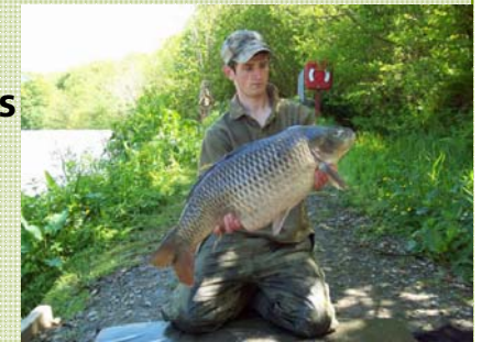
20lb 4oz common