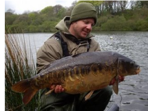
An early spring mid 20 - the rewards are there.

the country has to offer, and we want to keep them that way. The carp grow to weights of over 30lbs and are over 30 years old.