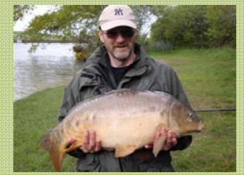
Right: 'Tango' 28lb 6oz, Melbury